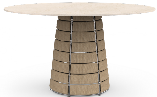
CORD dining table