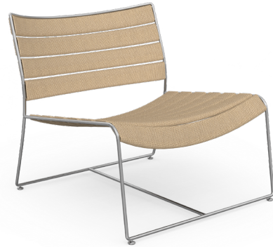
CORD lounge chair