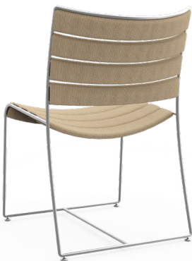
CORD dining chair

The Cord collection consists of a sun lounger, a low armchair, a chair and a dining table with a porcelain material top, with which you can design both rest areas and dining areas.