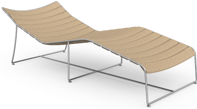
CORD chaise lounge