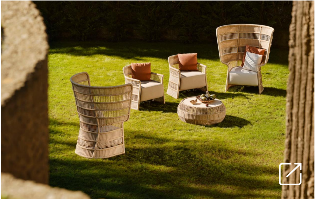
ESCALA Lounge Chair by Fabio Novembre | POINT