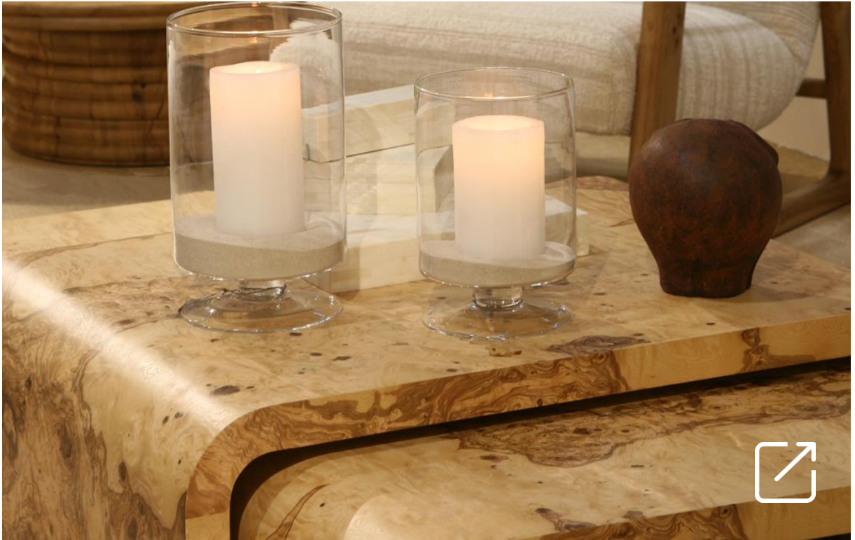
SERENGETI Coffee Table Set | BRUCS