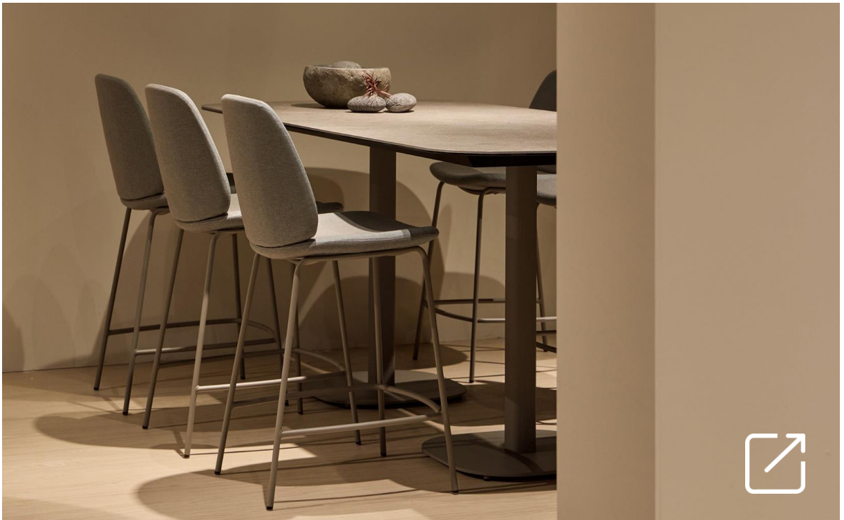
HORTA Table & LISSE Stool | MOBLIBERICA