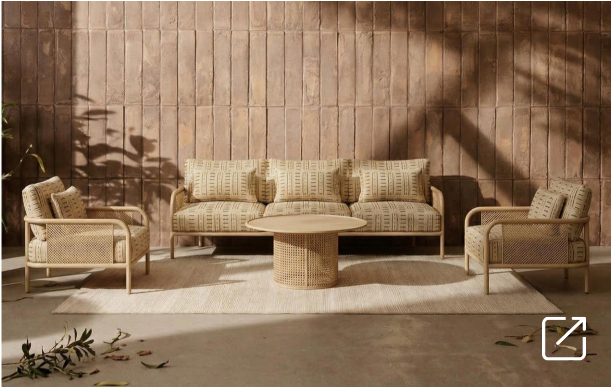
MAGNA Outdoor Lounge Furniture by ILMIODESIGN | iSiMAR