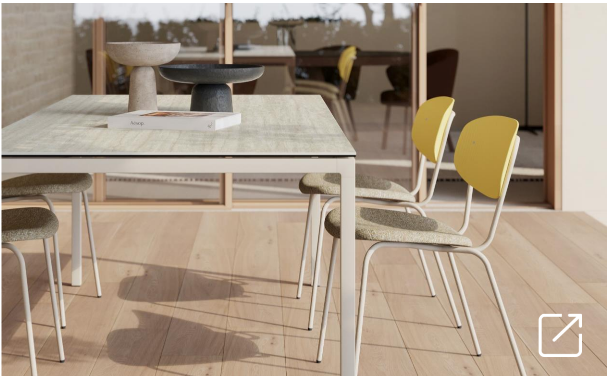
VAIREA Chair by YONOH Studio | MUSOLA