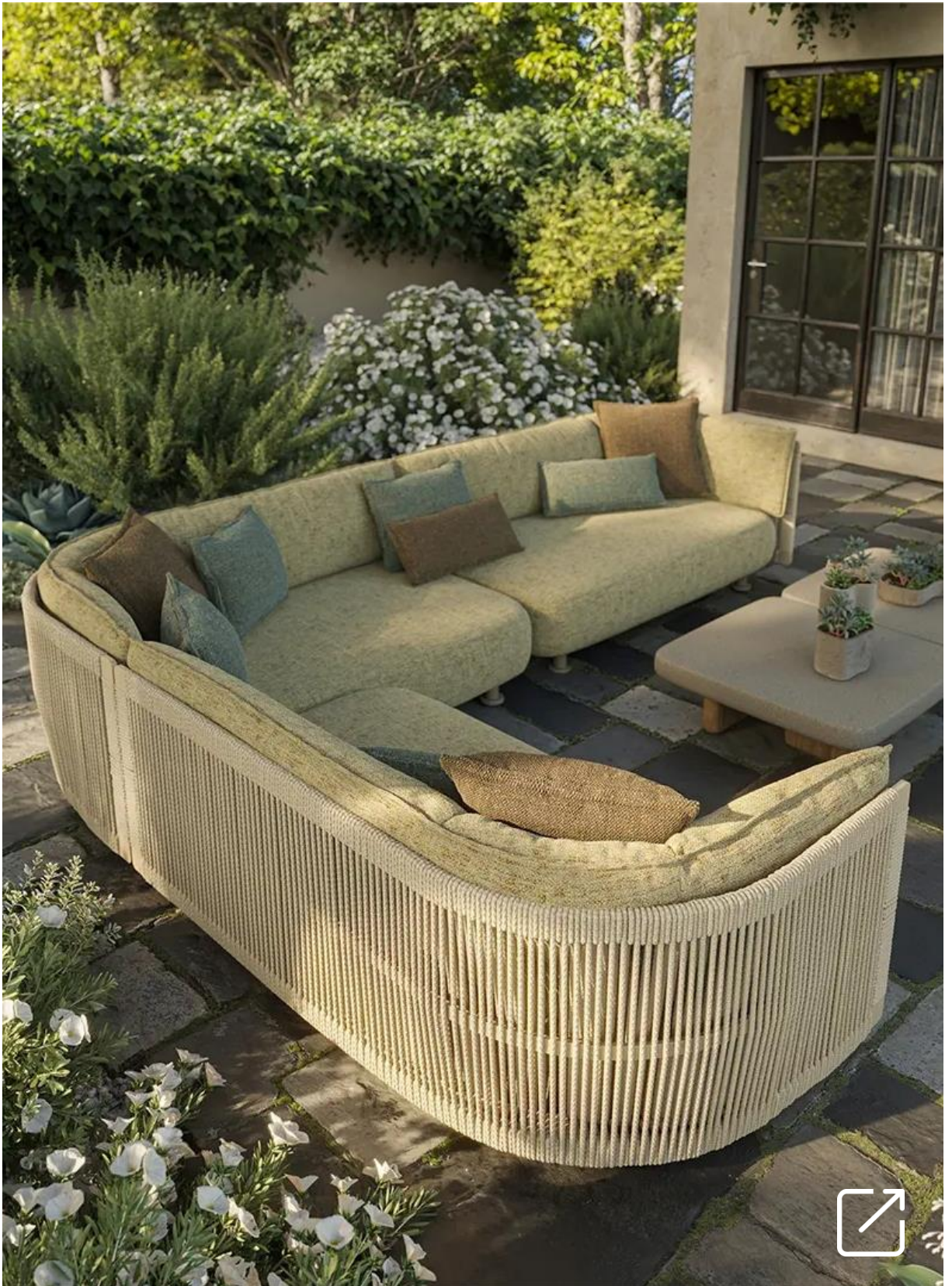
SERRA Outdoor Lounge Furniture by Jean-Marie Massaud | VONDOM