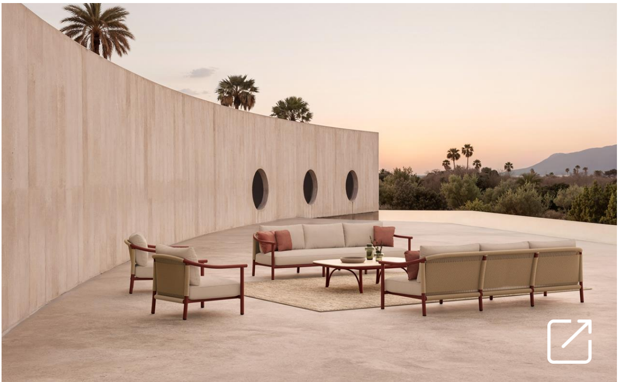
ARATA Outdoor Lounge Furniture by Valerio Sommella | SKLD Studio