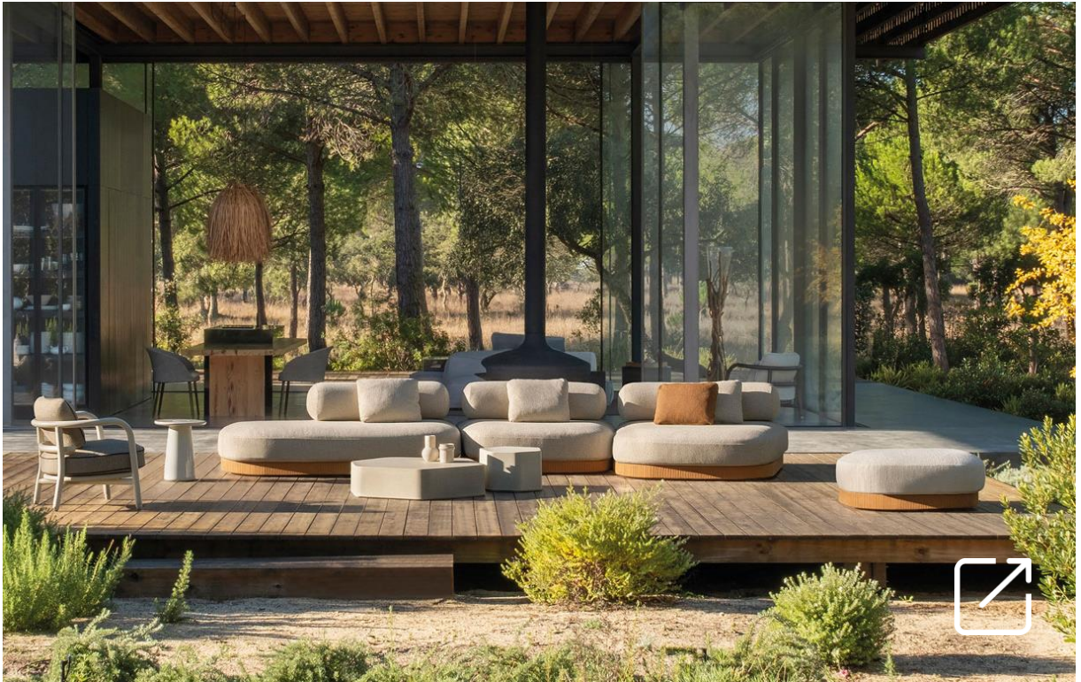
BRAE Outdoor Lounge Furniture by Norm Architects | EXPORMIM