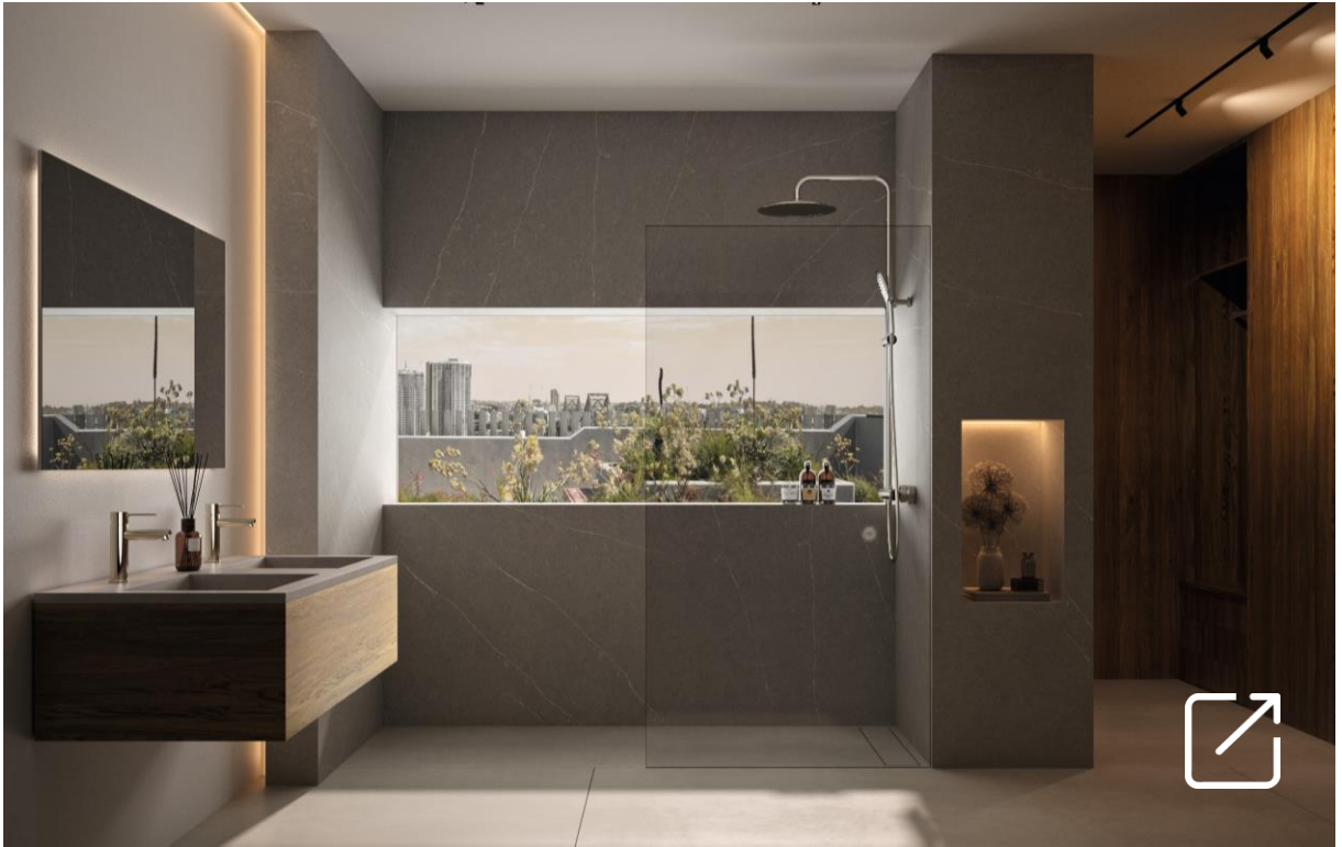
MAMMA MIA Bathroom Tapware | RAMÓN SOLER