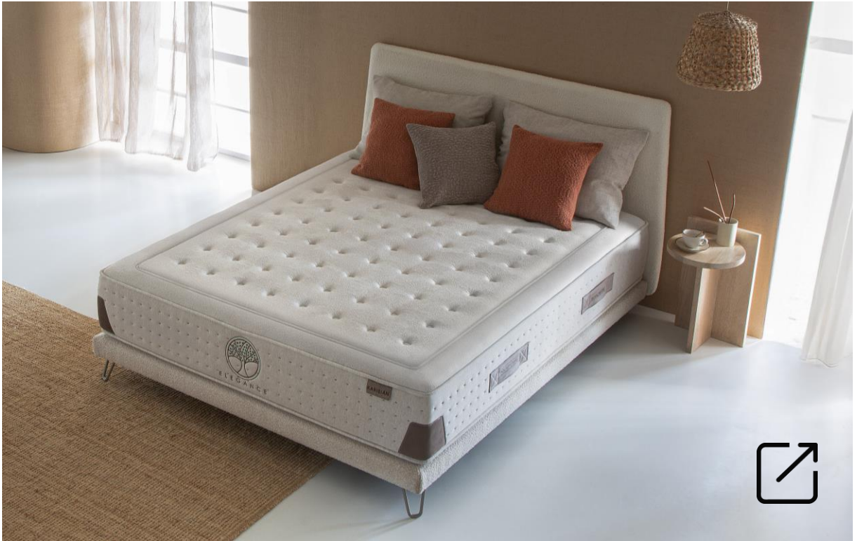
ELEGANCE Mattress | KARIBIAN Descanso