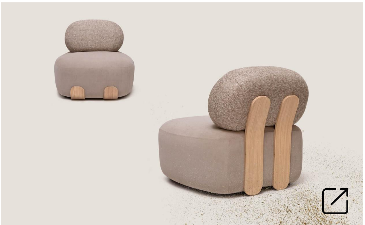
HEILAN SUPER Lounge Chair | CASUAL Home & Contract