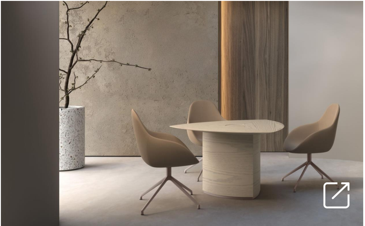
CONNECT Conference Table | HURTADO