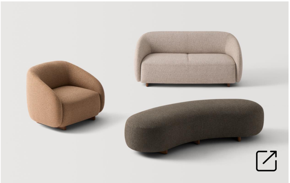
ONEM Sofa by Studio Inclass | INCLASS