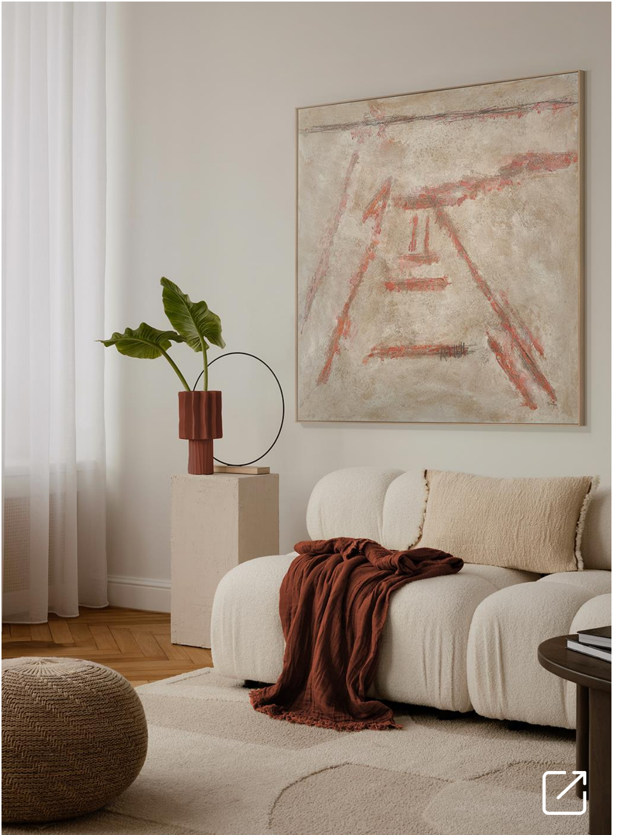
ARENA 05 Painting by Diego Serra | PERSPECTIVA 10