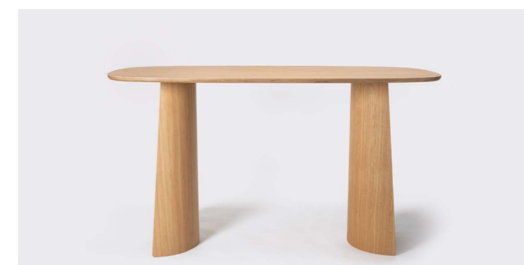
GIN TABLE H110