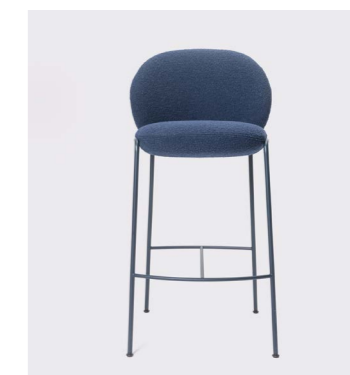
GIN STOOL H75