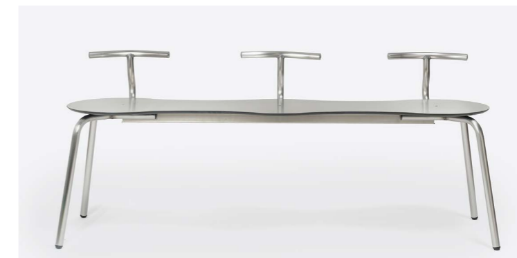
TAM INOX BENCH TRIPLE