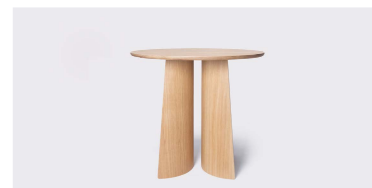
GIN TABLE H75