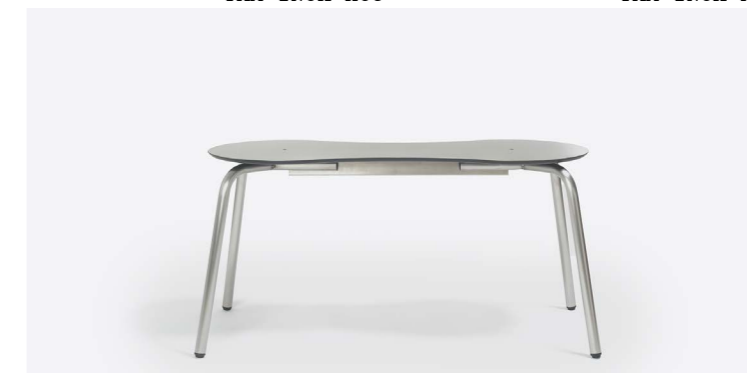
TAM INOX BENCH DOUBLE