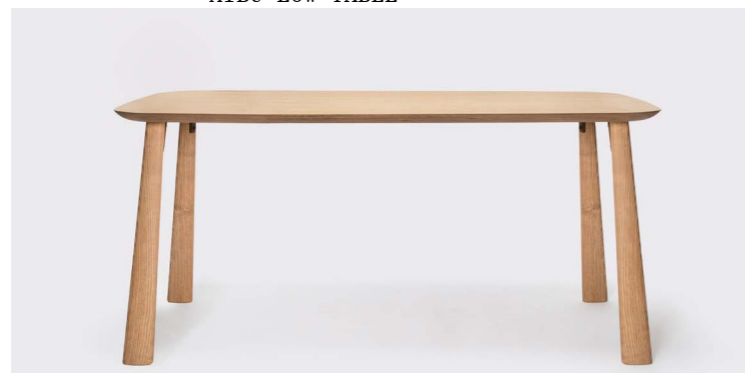
MIBU TABLE H75